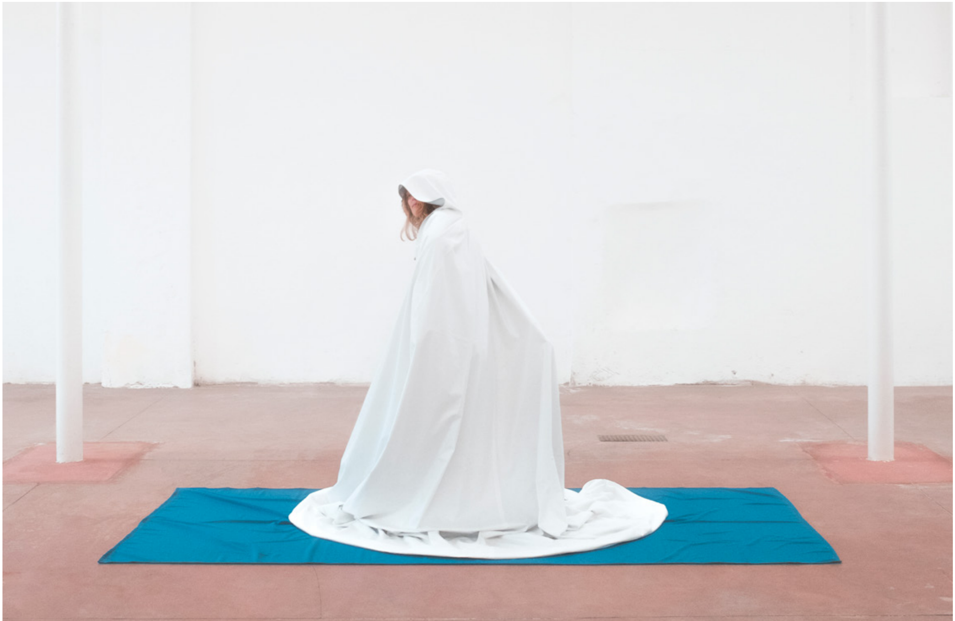
installation view at Cittadellarte, Fondazione Pistoletto, Biella, IT