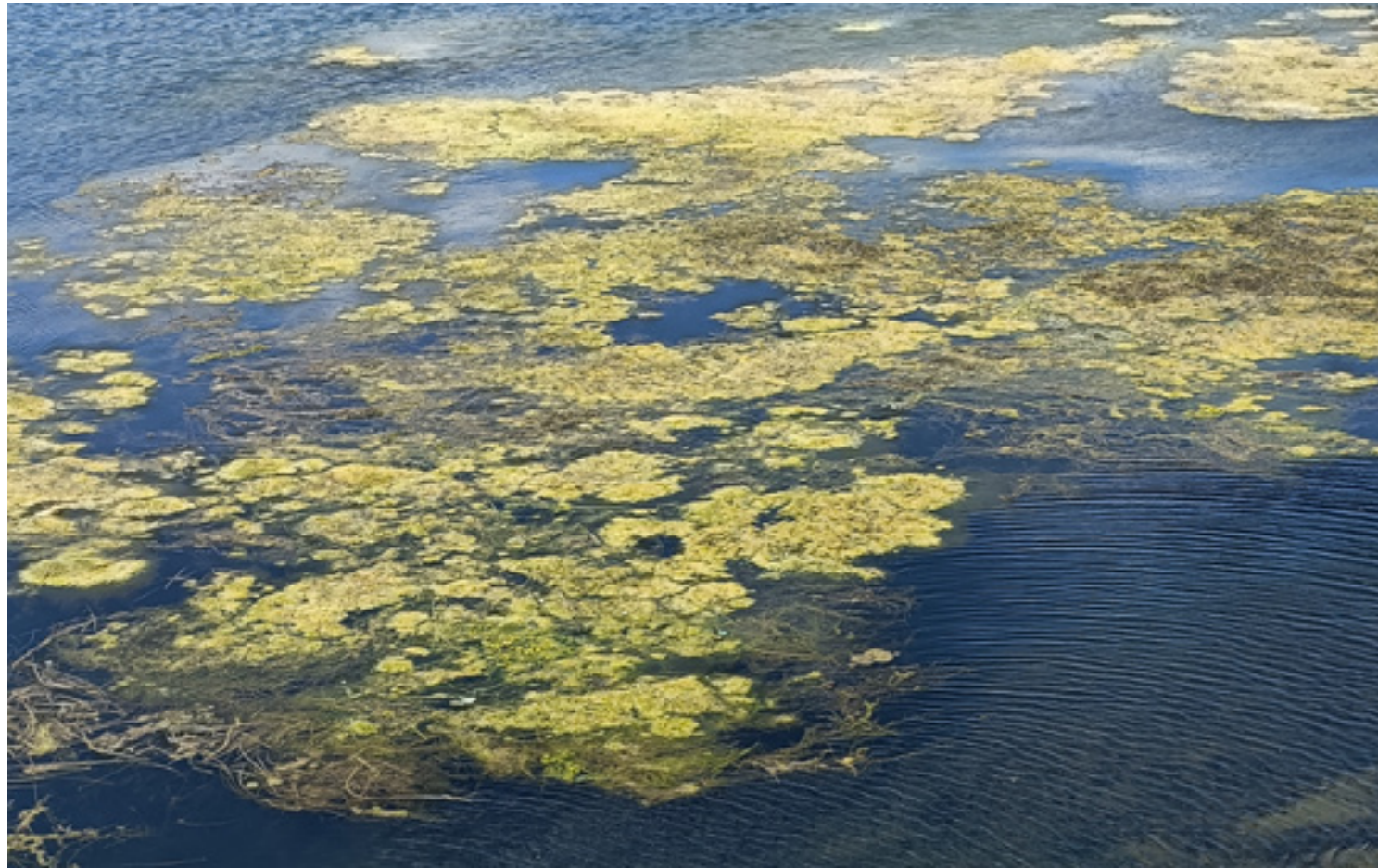
Sozopol port, Bulgaria