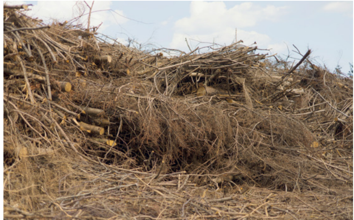
trees felled due to bark beetle, Lozio, Bergamo