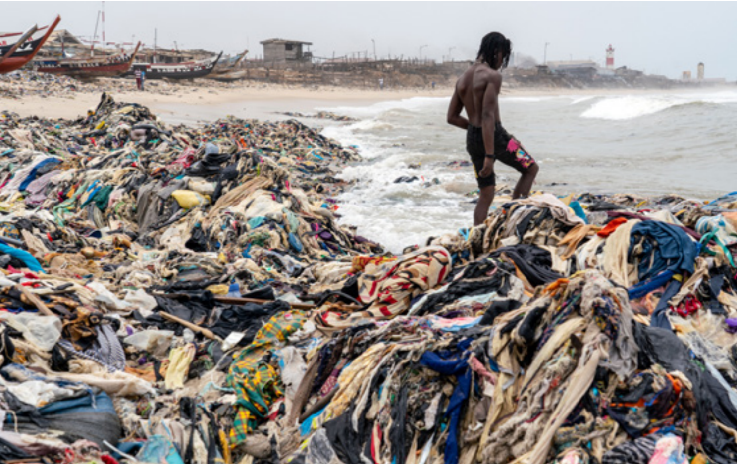
Accra beach, Ghana