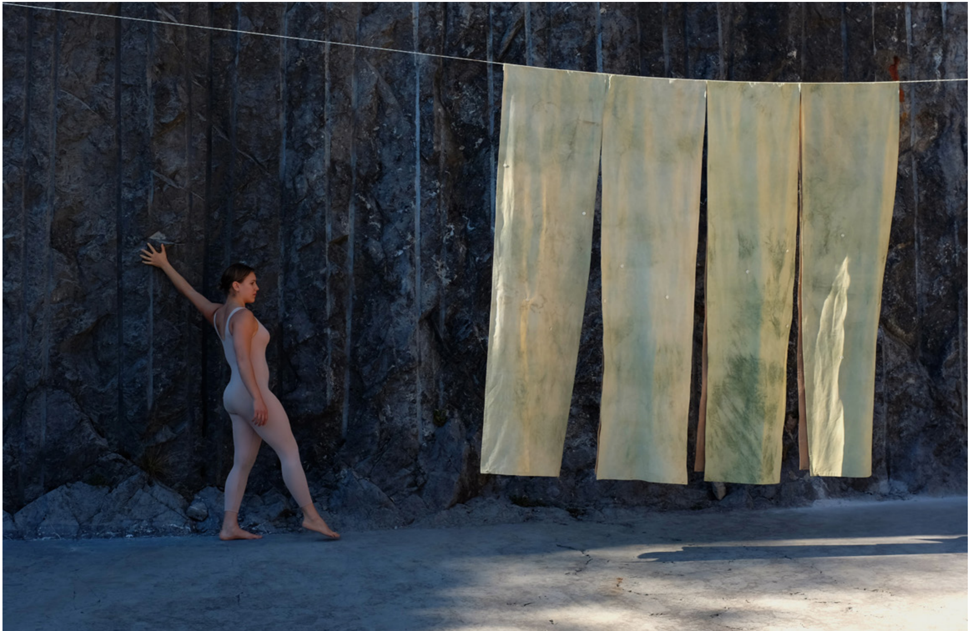
installation view at Sommaprada quarry, Bergamo, IT