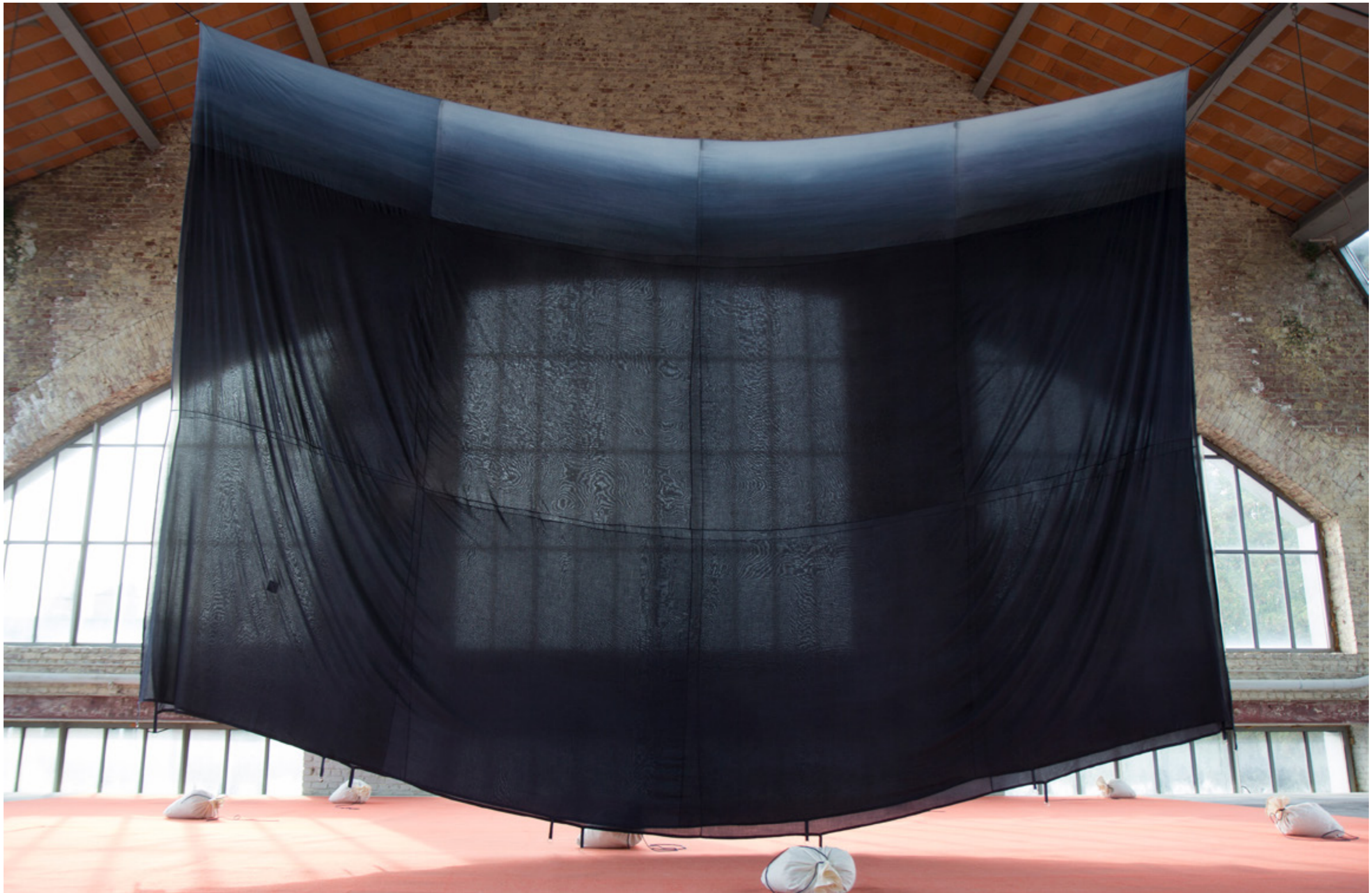
installation view at Foundation Volta XL, Brussels, BE