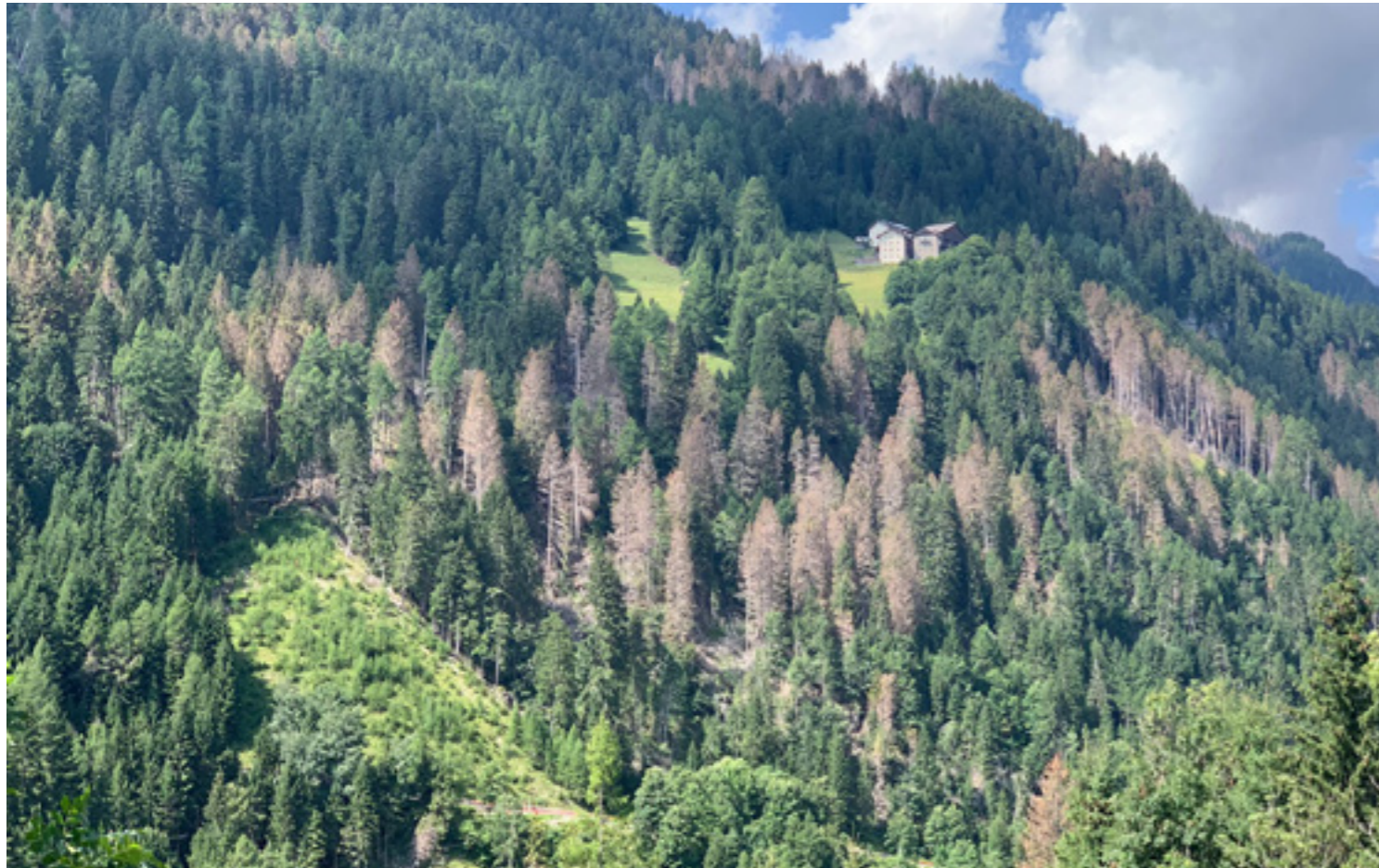
bark beetle infestation