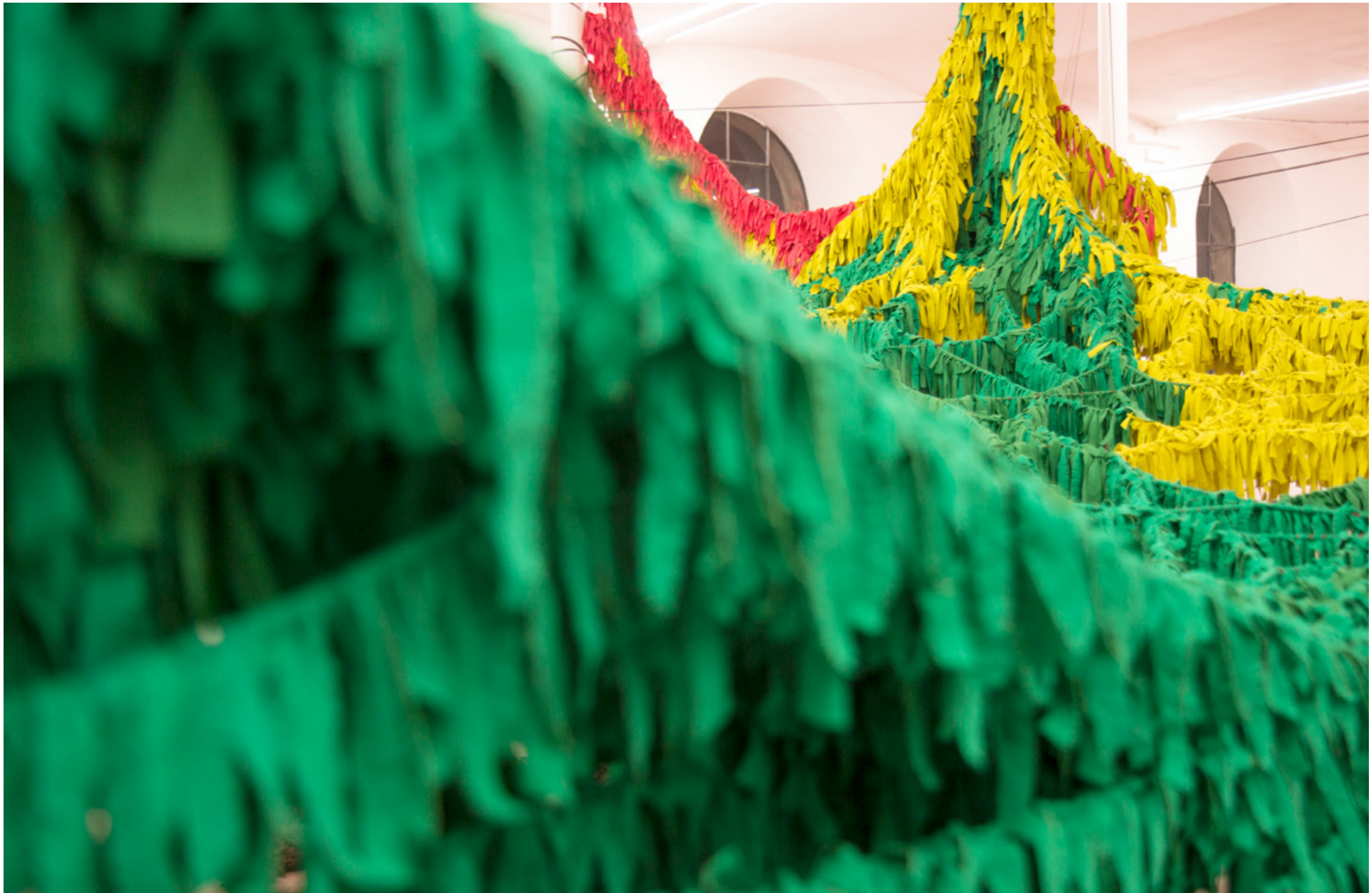
installation view at Cittadellarte, Fondazione Pistoletto, Biella, IT