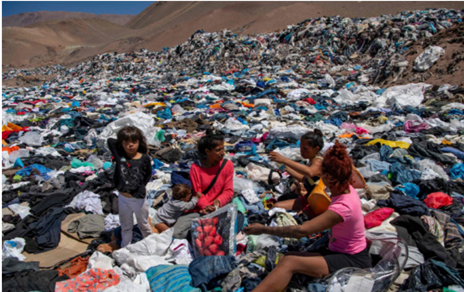
Atacama Desert, Alto Hospicio, Iquique, Chile