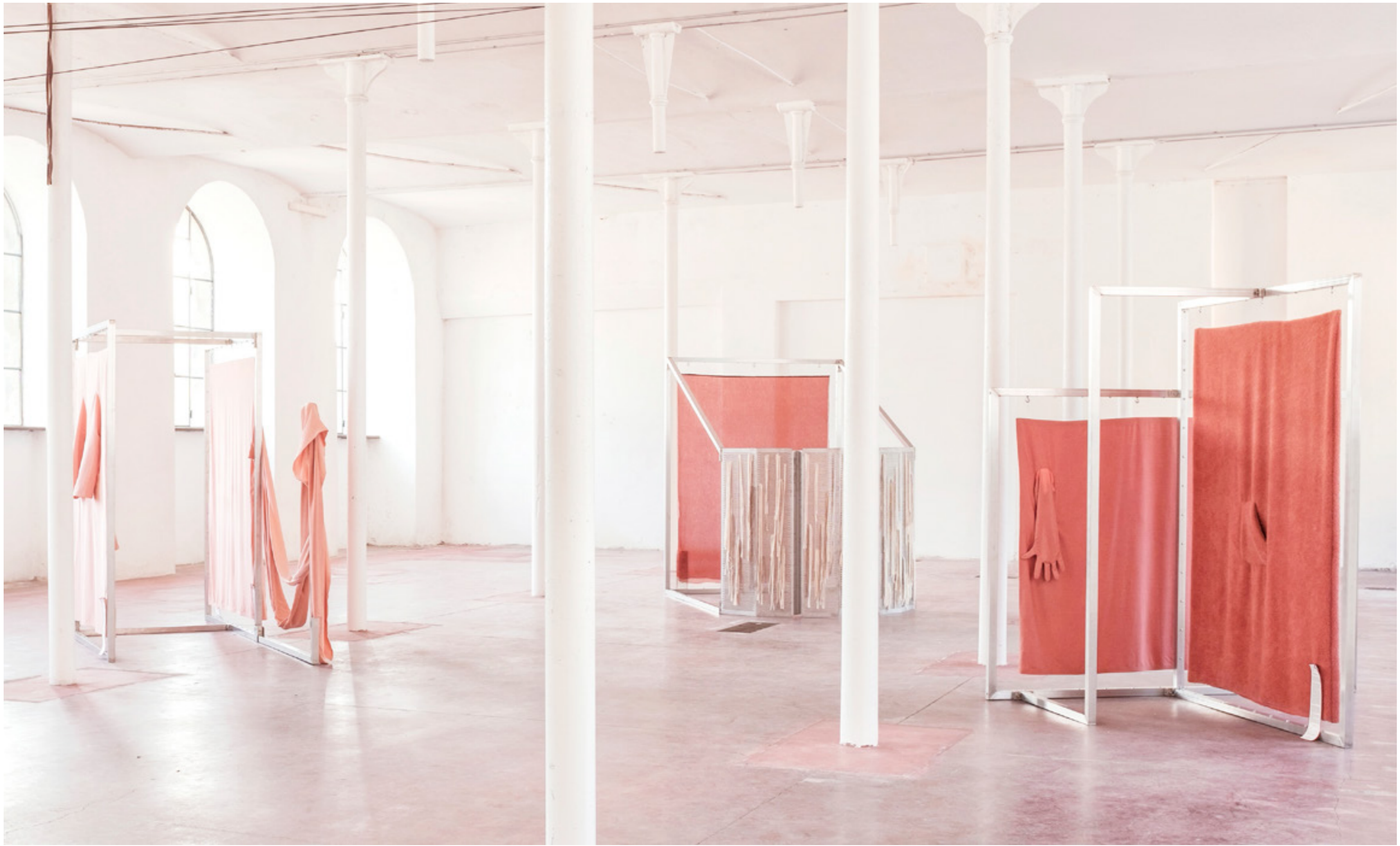
installation view at Cittadellarte, Fondazione Pistoletto, Biella, IT