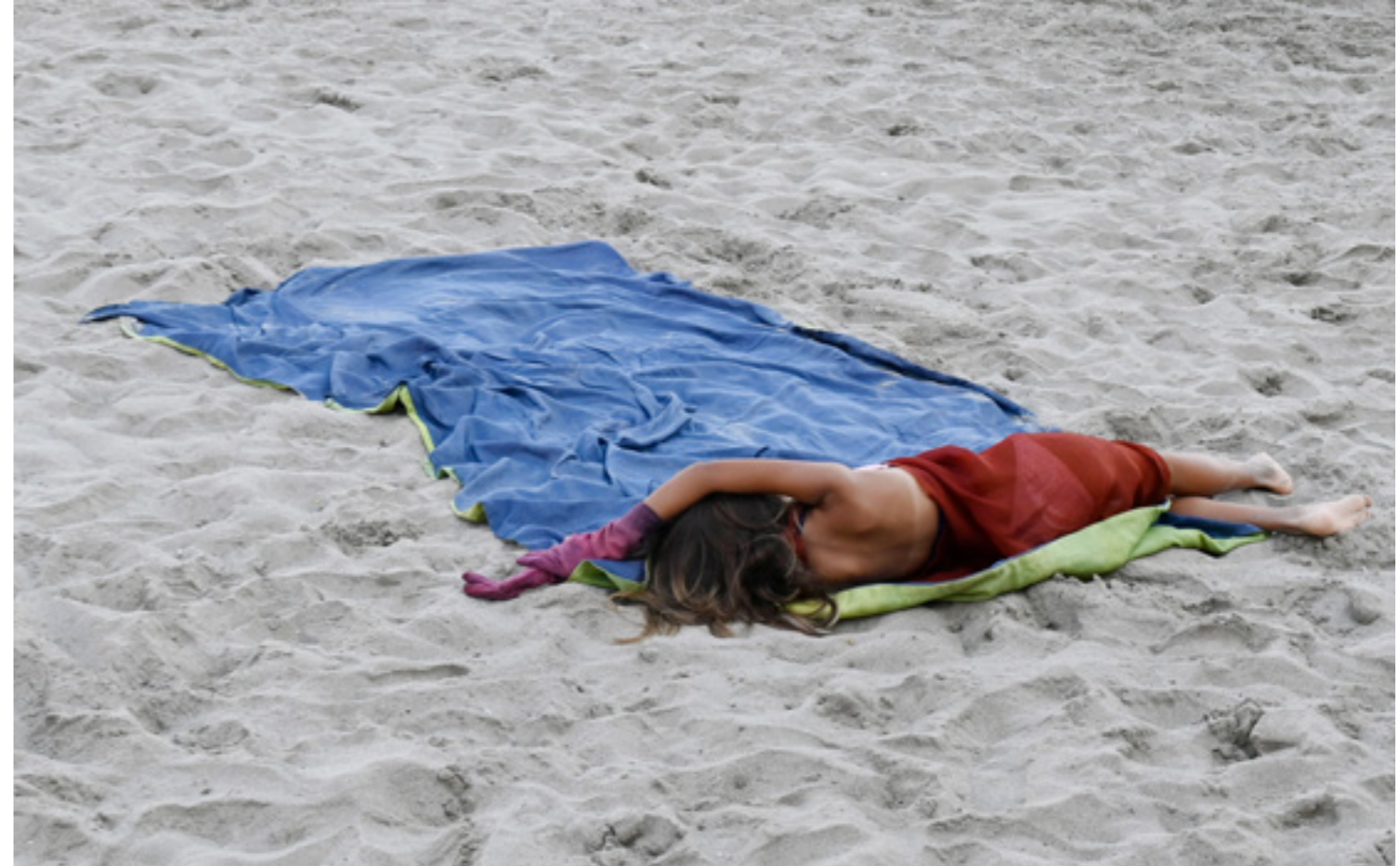
installation view at Sozopol Central Beach, Bulgaria