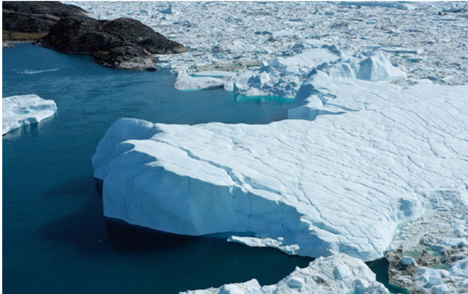
Greenland Ice Cap